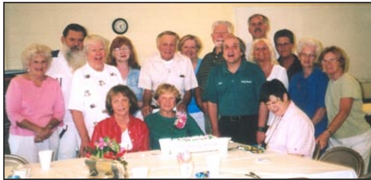
LWML members and guests enjoy a birthday celebration at a recent Open Arms meeting at Holy Cross-South Daytona, FL.

"Families of the congregation often help serve, and this gives the youth an insight into the life of these folks. The numbers are growing, and we are happy to provide this service." □