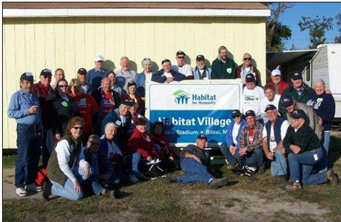
On a recent Thrivent Builds Worldwide trip to Biloxi, Thrivent members from the Florida and Mid-South regions helped build several homes as part of the Thrivent Builds Worldwide Gulf Coast Community program.

We are not just building homes; we are rebuilding an entire community!