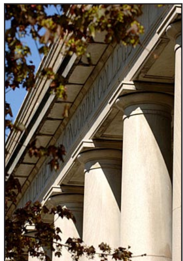
Concordia River Forest Pillars

Funding for the certificate program was provided in part by a grant from the Rupert Dunklau Foundation, which was established in 1968 and concentrates its efforts towards charities and educational institutions of the Lutheran Church. □