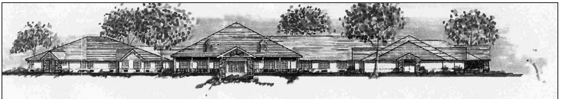
Lutheran Haven, a ministry of the SELC District of the Lutheran Church-Missouri Synod, broke ground for its new nursing home and assisted living facility on Sunday, January 23. The new facility, which will be almost double the size of its current facility, will be completed in 13 months at a cost of $8.9 million.

Affiliated with the SELC District of the Lutheran Church Missouri Synod, Lutheran Haven has been a provider of retirement services for more than 50 years.